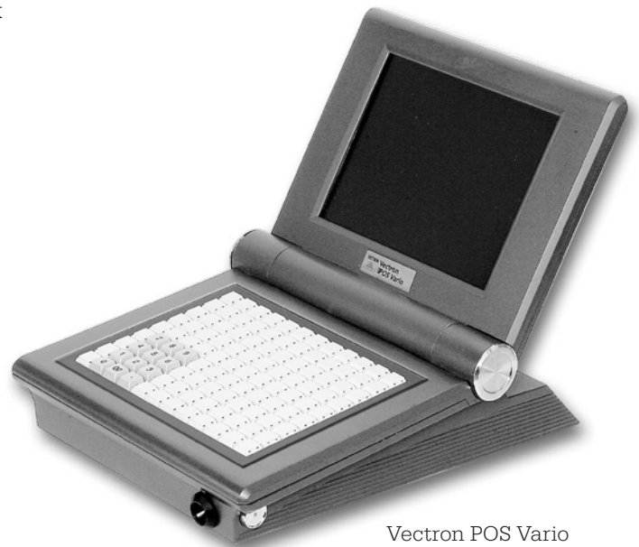
Vectron POS Vario with raised keyboard