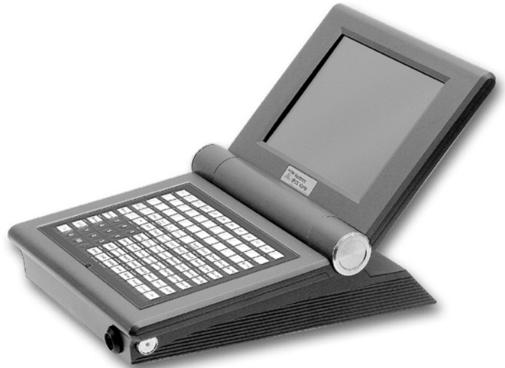
Vectron POS Vario with flat keyboard