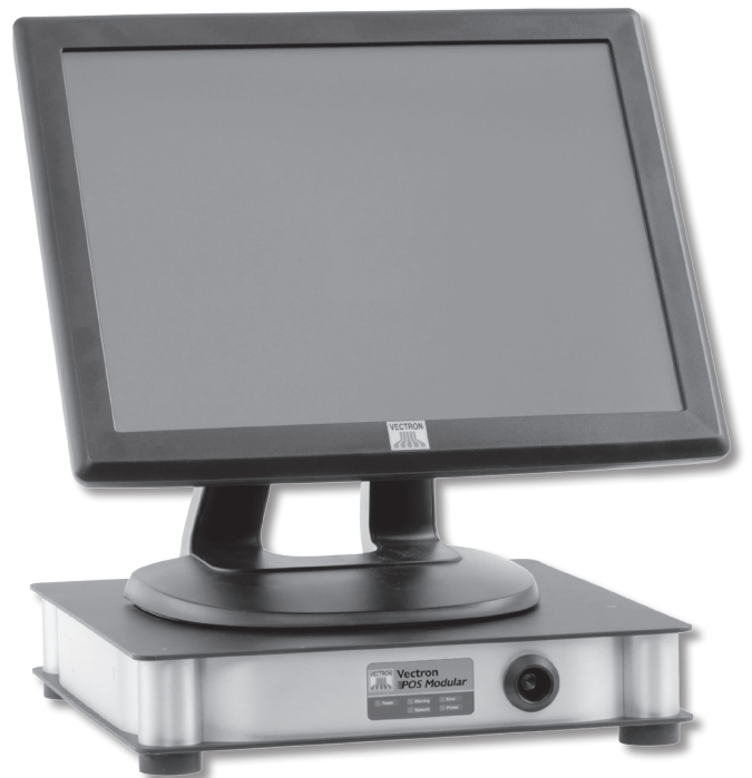
Vectron POS Modular with Monitor Vectron D151T