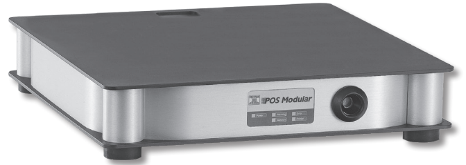
Vectron POS Modular with „Addimat“ lock